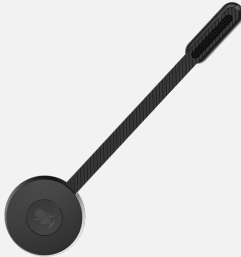
Detachable boom-microphone S+ and C+ configurations