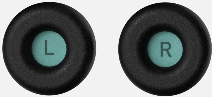
• On-ear pads S and S+ configurations