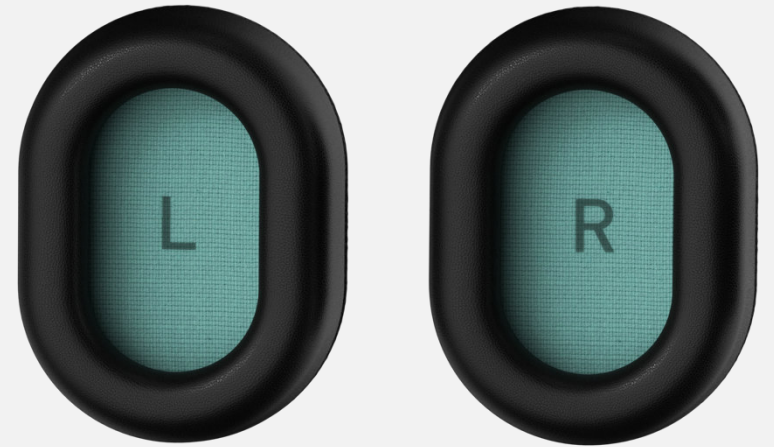
Over-ear pads C and C+ configurations