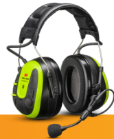
3M™ PELTOR™ WS™ ALERT™ X+