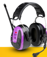
3M™ PELTOR™ WS™ ALERT™ XPI+