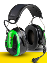
3M™ PELTOR™ WS™ ALERT™ XPV