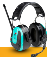
3M™ PELTOR™ WS™ ALERT™ XP+