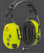
3M™ PELTOR™ WS™ ProTac™ XPI Headset