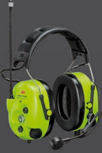
3M™ PELTOR™ WS™ LiteCom Pro III Headset