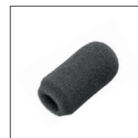
3M™ PELTOR™ Wind shield M171/2