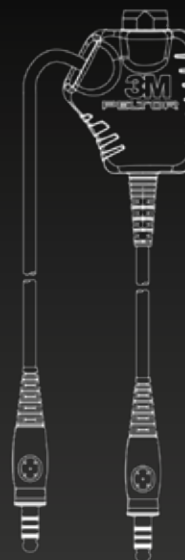
PPN: 23-0052 Download Cable Splitter