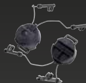
P3ADG-F SV/2 Rails attachment