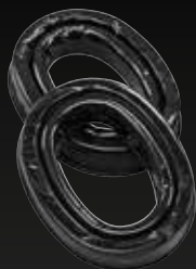
HY80-EU Gel cushions