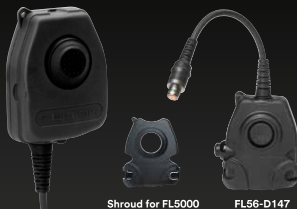
Shroud for FL5000