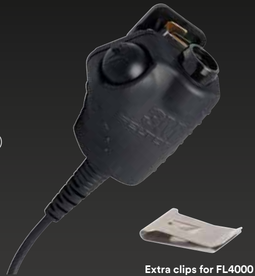
Extra clips for FL4000