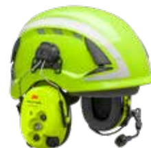
MT15H7P3EWS6 / MT15H7P3EWS6-111