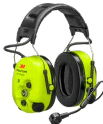
MT15H7AWS6 / MT15H7AWS6-111