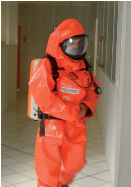
Contaminated zone analysis.